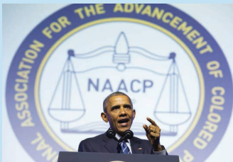
President Obama at NAACP Convention (AP)

PHILADELPHIA (AP) — President Barack Obama says the United States can no longer close its eyes to the problems in its criminal justice system.